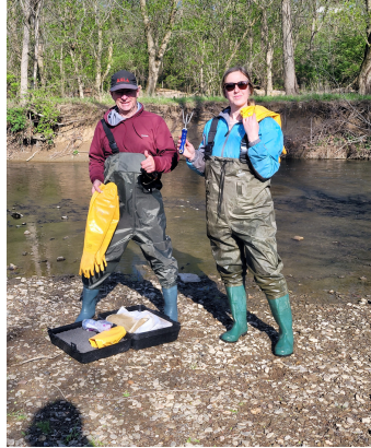
The water crew all decked out