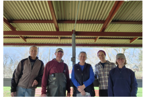
It's a team effort

Here are the macroinvertebrate results for the year.