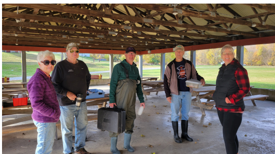
A few of our many volunteers this monitoring year. Thank you!