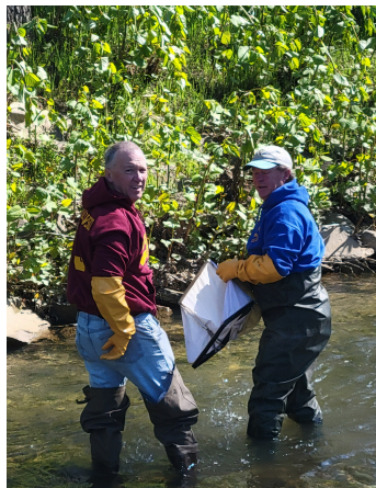
Gathering the Macros

The four sites remained: Chartiers Run behind American Legion in Houston; Chartiers Creek main stem at Houston Ballfield and Scotty's Ice Cream; and Little Chartiers at Linden Road and Linden Creek Road. This year we also completed water monitoring on 10 Mile Creek where we found a very cool Caddisfly. Although not in the Upper Chartiers Creek watershed, it is a watershed within Washington County and an organization within the Watershed Alliance.