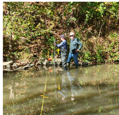
Measuring water flow